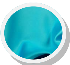
All Satin Colors