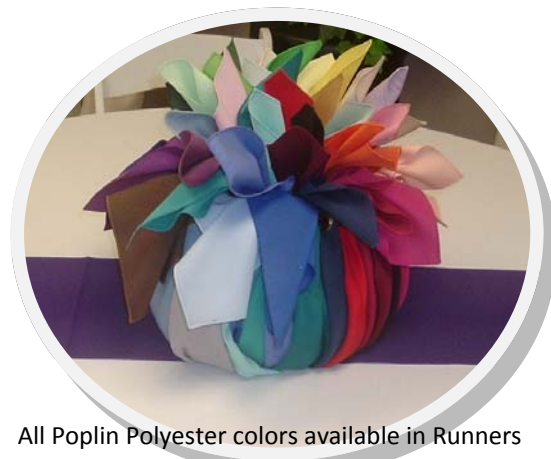
All Poplin Polyester colors available in Runners