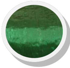
All Lame' Colors