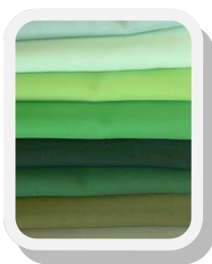
Shades of Green