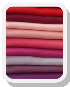
Shades of Red/Purple