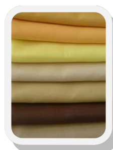
Shades of Yellow/Brown