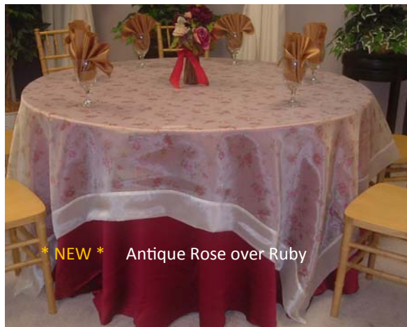
* NEW * Antique Rose over Ruby