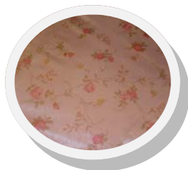
* NEW * Antique Rose

Island Green: 90x Sq, 60x120, 120 Rd, 20x20 napkins